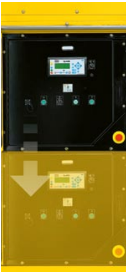
Re-positionable control panel

This multi-purpose control system makes the QAC series generator an outstanding, easy-to-operate machine, offering a single solution to the most varying applications.